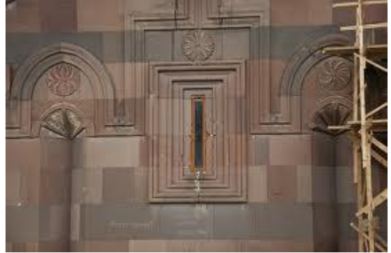
The Monastery of Harich or Harichavank , 7th century, located near the village of Harich, Armenian

Besides the meaning that “Everything Armenian starts from the eternity sign”, this sign has a punctuation function also: it is applied to divide a text into parts (chapters), as well as to design a text or a poem or to make references like an asterisk sign (*).