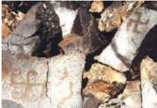
Ancient Armenian stone pictures (Stone Age)

The earliest roots of round whirling sun-like symbols in the Armenian Highland are rock inscriptions from the Stone Age.